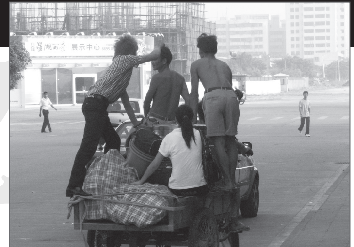
Migrant Workers in Guangdong

The media has often portrayed rapid urbanization in China as leading to a larger middle class and greater consumption rates. That narrative, however, seems problematic given China's current configuration of economic and legal inequities. There are many myths behind the perception and sustainability of China's recent economic rise. Urbanization remains one of the biggest.